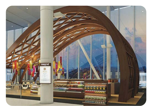
Image 6.1: Toronto T1: Speciality food, closure and openness coexist