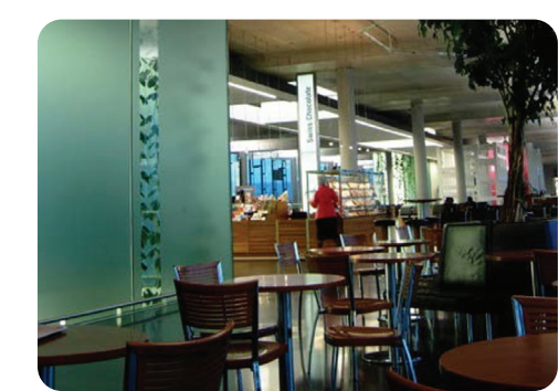
Image 6.13 Zurich: Food venue and green insertion to build on the terrazzo.