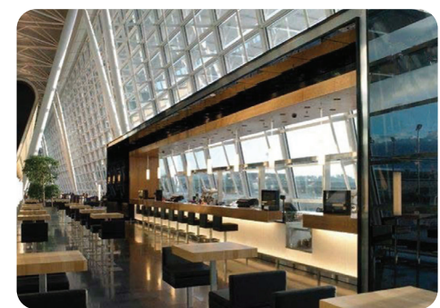
Image 6.6: Zurich: Airside bar with open views, inviting, and beautiful