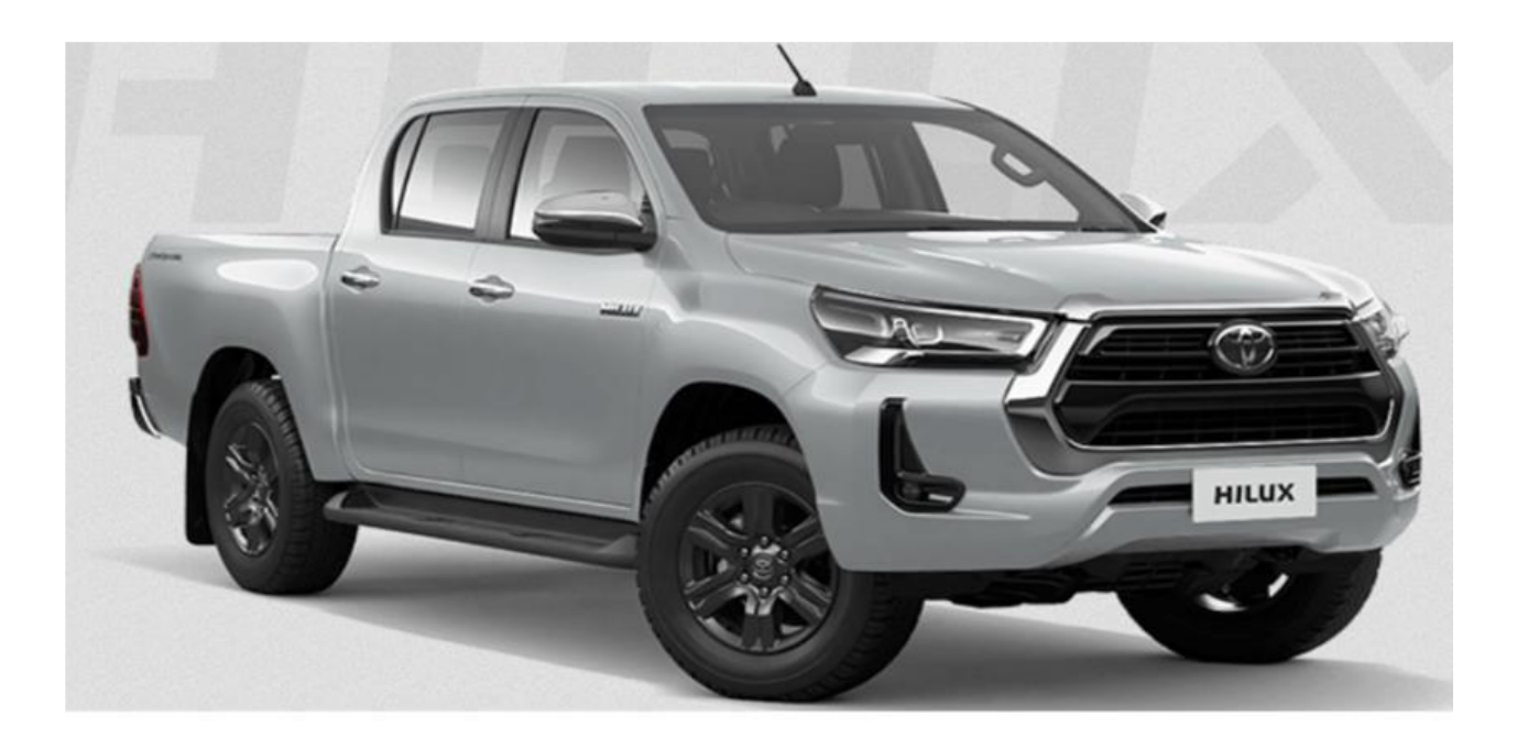
4X4 Double cabin Country TMT model (2400cc Manual Transmission) (GUN125R-DTFLX) JG